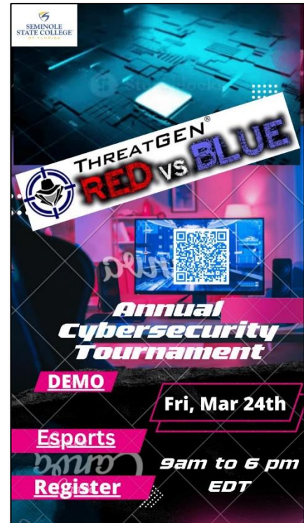
Figure 1 - Event poster

ThreatGEN worked with Seminole to provide a cost-effective implementation for this event at a total cost to Seminole of $2,000 invoiced from ThreatGEN. ThreatGEN agreed to work with Seminole to secure at least 4 sponsors to help underwrite the event as well as support the goal of the college.